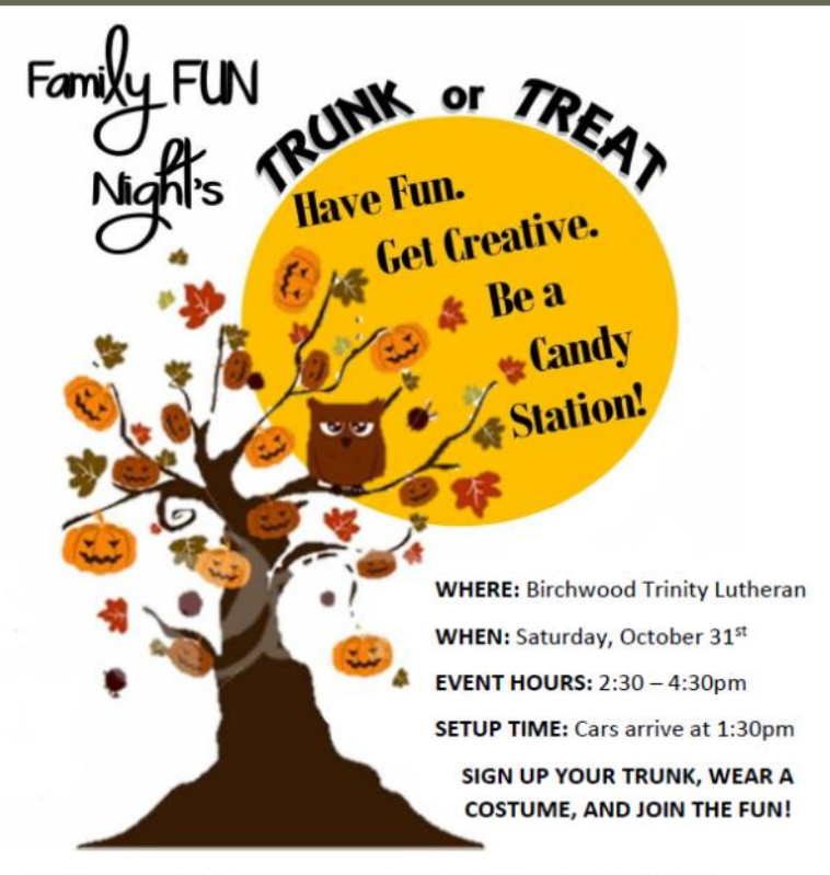
TRUNK-OR-TREAT IS A SUPER FUN AND FREE COMMUNITY EVENT FOR THE WHOLE FAMILY! CANDY DONATIONS ARE WELCOME!! DROP OFF AT CHURCH WITH JULIE!